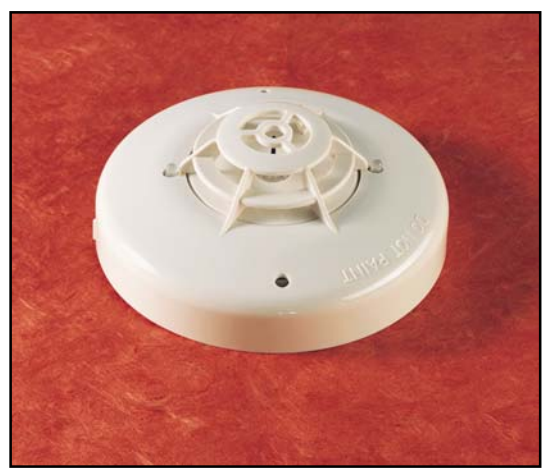
Shown without base